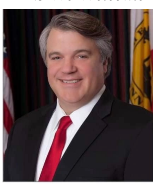
Frank Colvett Memphis City Councilman, District 2